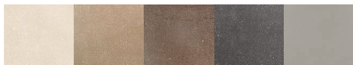
'Amande' 'Caramel' 'Noiestte' 'Cendre' 'Perle'

Buxy triple-pressed porcelain stoneware is available in 3 surface finishes, for internal & external applications, and a range of sizes that include large format 594 x 1190mm and 895 x 895mm.