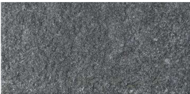
GRK surface finish shown in detail above - 'Naanse' colour

To discuss these and other materials featured on the Rocks On website, please contact your Rocks On Representative for further information & assistance.