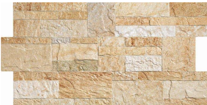
Interlocking piece shown above in 'Royal' colour