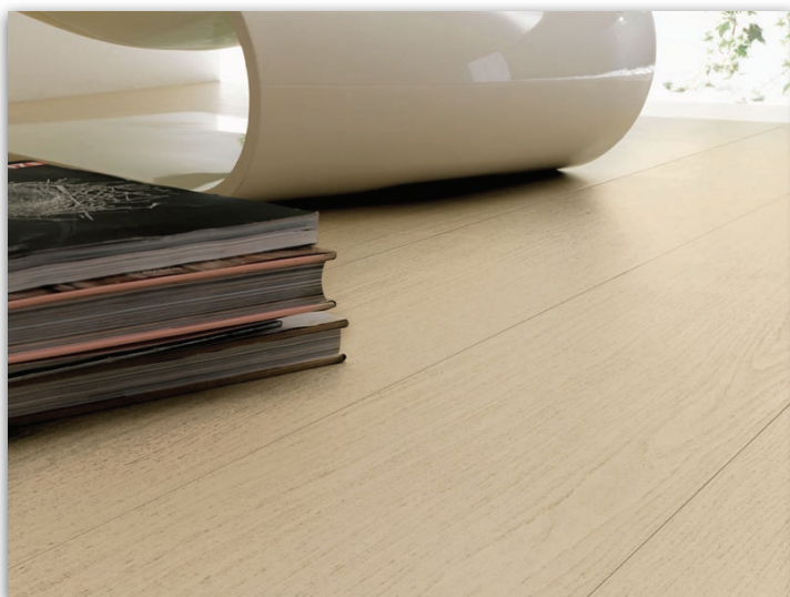
Kerlite Plus Oaks - 'Timber' colour shown above