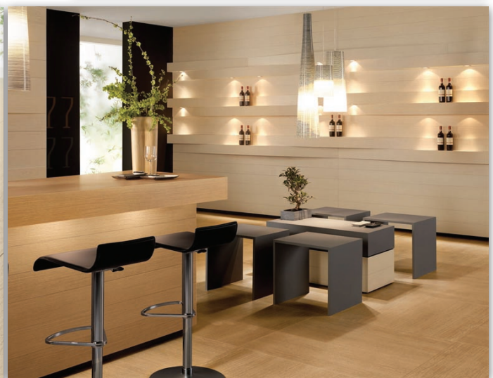
Kerlite Plus Oaks - 'Land' colour shown above