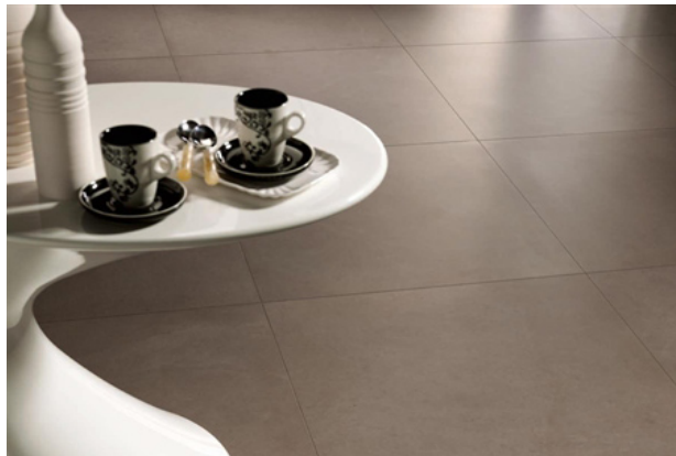
Elegance - 'Farini' colour shown above

Elegance says it all! This beautiful series of porcelain stoneware is the re-creation of the finest hand selected limestones that have been carefully honed & polished. This is obtained by the use of soluble coloured salts, which penetrate into the tile body, then machine finishing the surface to create an elegant feel. Elegance looks stunning in both classical and modern interiors. The introduction of the new colour 'Farini' adds warmth to the range. Elegance is ideal for a wide range of applications including commercial indoors & residential in & out doors, foyers, boutiques, living areas, balconies, kitchens, bathrooms, walls and step treads.