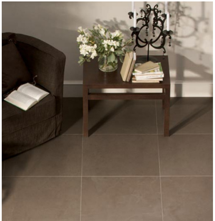
Elegance - 'Farini' colour shown above

The 'Farini' colour in Kerlite Plus recreates the look of light tobacco coloured limestone and is a true innovation in the building industry - available in sizes up to 1000 x 3000 x 3.5mm.