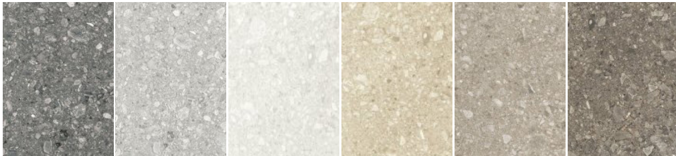
Antracite Grigio Bianco Beige Taupe Tortora

Applications: Commercial & residential indoor floors & walls and residential outdoors, including shopping centres, foyers, restaurants, boutiques, galleries, living rooms, patios, kitchens & bathrooms.