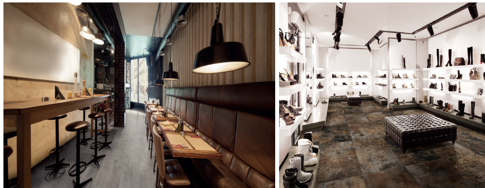
Sydney showroom by appointment